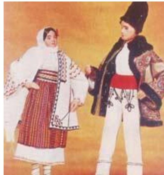
Music Andra Maria Tanase

Her spirit is alive, there is Maria Tanase Festival organized every year in Craiova.