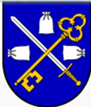
Coat of arms