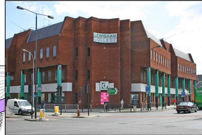
Deptford Campus 2 Deptford Church Street