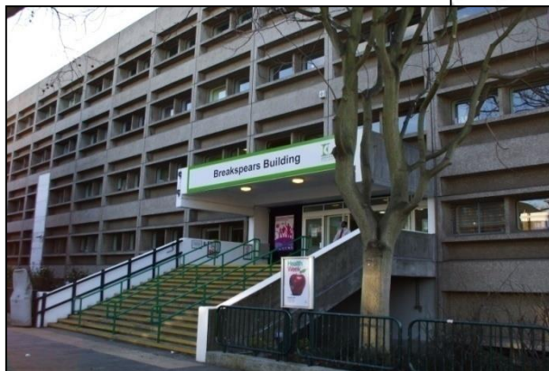
Lewisham Way Campus Lewisham Way