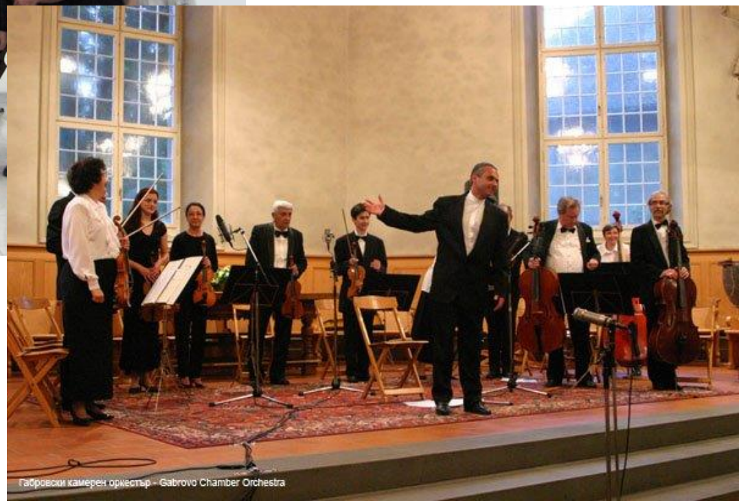
Габровски камерен оркестър - Gabrovo Chamber Orchestra